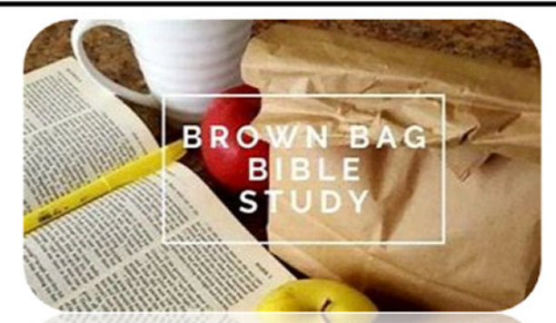
Brown Bag Bible Study

Performances during Worship the 2nd Sunday of each month All men are welcome to join!